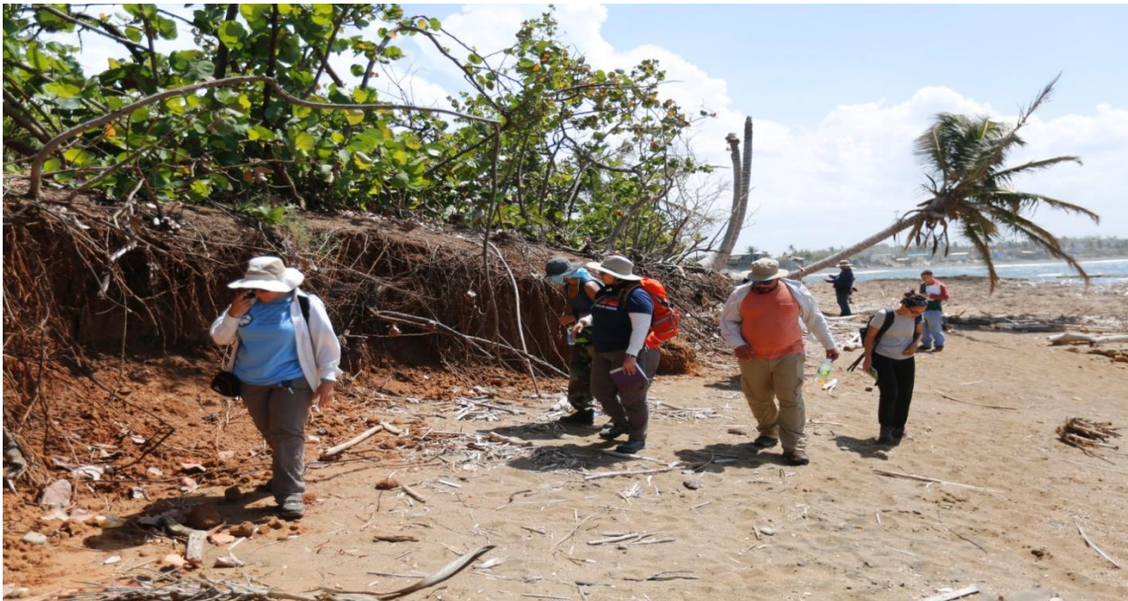
Photo 1. Impact to Mound 1 of the Tierras Nuevas coastal ceremonial site in Manati, Puerto Rico. (Photo taken in 2018 by Fabio Esteban Amador).

The identification of needs with the participation of concerned communities is required not only concerning the ICH affected by the hurricanes, but also with regard to those cultural expressions and practices to be mobilized by the population as essential resources for its resilience and recovery, in particular in displacement context. The hurricanes have transformed practices of daily life and their relations with time, space and geographic context. The emerging processes may take many different manifestations. As practitioners and academics it is our duty to record and actively participate in these processes as facilitators, careful recorders and researchers. We need to make information available to the people living there so that they can fight to maintain their cultural identity with data and facts. As a reaction to the hurricanes' traumas, tangible and intangible heritage will reflect evident change in its definition, purpose and scope, and can be expected to take a central role in the recovery process for the redefinition of culture after disaster.