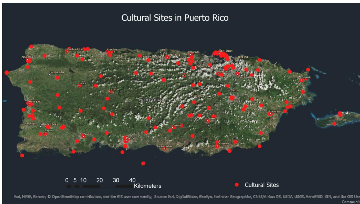
Figure 2. Map illustrating a selection of threatened cultural heritage sites in Puerto Rico. The map marks only sites within 20m of elevation from sea level, and all the properties listed in the National Register of Historic Sites (data available in https://www.nps.gov/nr/research/ ). Note that this map does not show all known archaeological sites on the Island. A complete and systematic assessment of impact to cultural heritage is still lacking.

The direct assessment of sites and structures included in the National Register for Historic Places is currently underway by the State Historic Preservation Office with support from specialists from abroad, including National Parks Service and FEMA (Rivera-Collazo, 2019). An initial assessment of the impact to historic structures was conducted by Para la Naturaleza and the School of Architecture of the University of Puerto Rico in October-November 2017, visiting 34 municipalities, and surveying 4882 historic properties (Sanabria and Luna-Serbiá, 2017). Safety conditions impeded access to other locations. Additional survey and impact assessments on coastal archaeological sites will be developed in collaboration with University of California San Diego and local volunteers. Before Maria, fourteen historic districts were recognized in Puerto Rico with an estimated total of 8850 properties. There are 225 state-listed historic sites outside historic zones as well as over three thousand other buildings that exist in dense areas eligible for historic-zone designation and an indeterminate quantity (possibly over a thousand) within rural areas. It is estimated that about two-thirds of contributing structures in historic zones were damaged in some visible degree. Major damage or total collapse was observed in ca. 7% of surveyed structures. This number might be even higher as structural damage might not yet be evident.