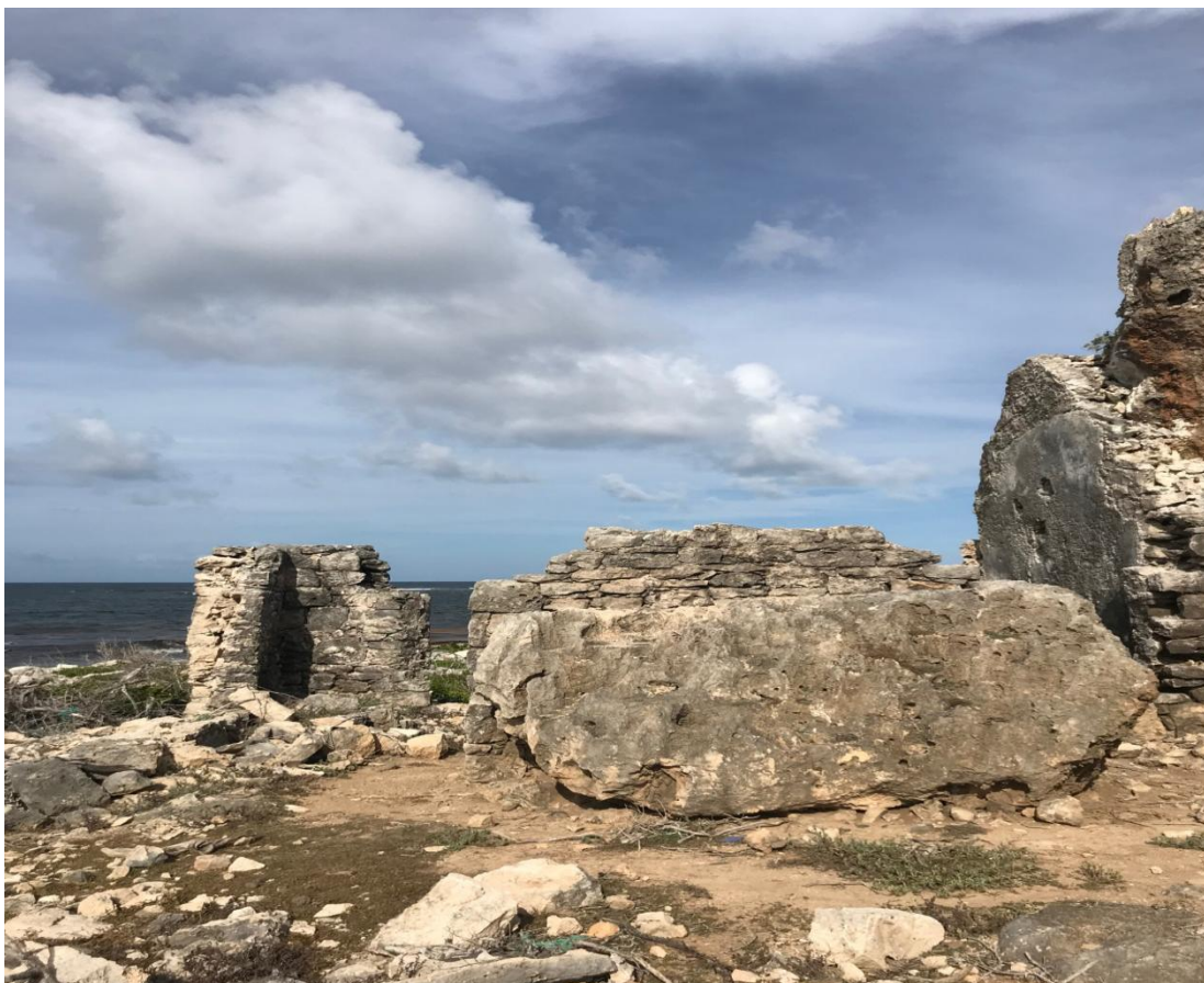
Photo 2. Gunshop Cliff, Barbuda. Walls collapsed after Hurricane Irma.