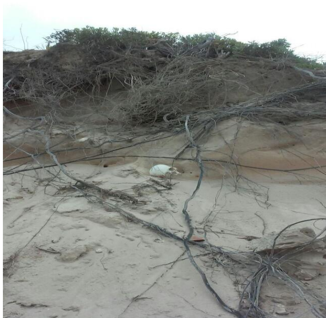
Photo 3. Seaview archaeological site, Barbuda. Hurricane Irma removed coastal sand dunes and exposed skeletons.